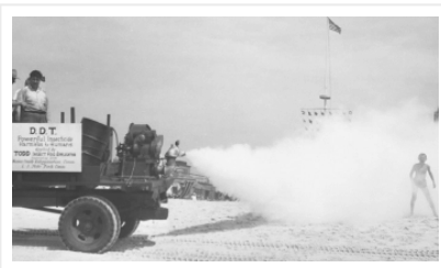
The REAL History of Polio - 20 Things You Didn't Know In "Health"