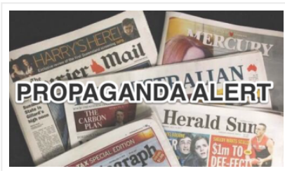
Murdoch's Daily Telegraph Propaganda Machine Running Overtime In "Australian-news"