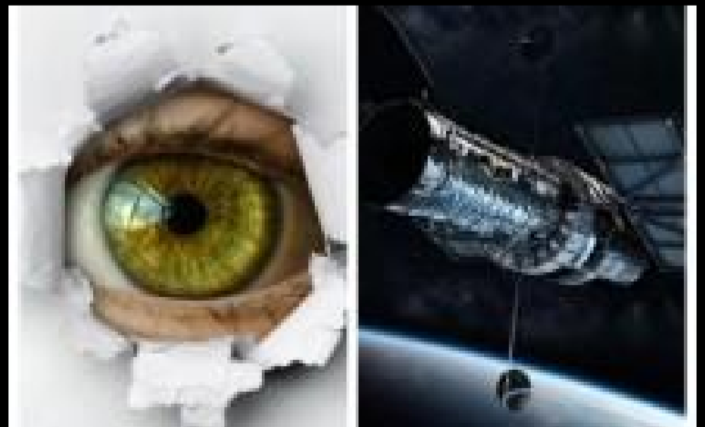
Clouds Are No Barriers For This Satellite; It Can Scan Building Structures Night Time Too