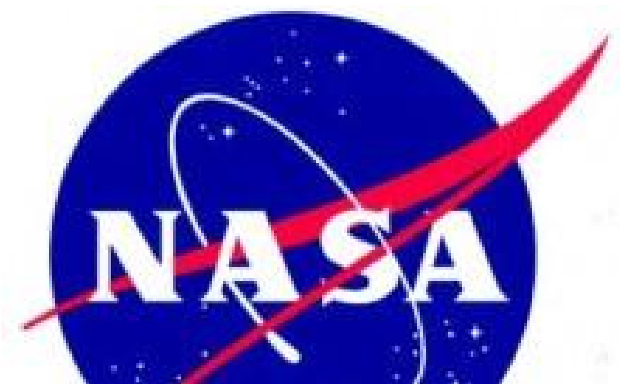
Trump Admin Sets Space Agenda For Future Missions On Use Of Nuclear Power