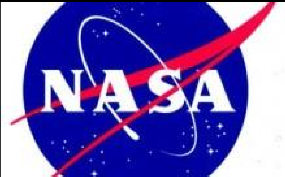
Trump Admin Sets Space Agenda For Future Missions On Use Of Nuclear Power