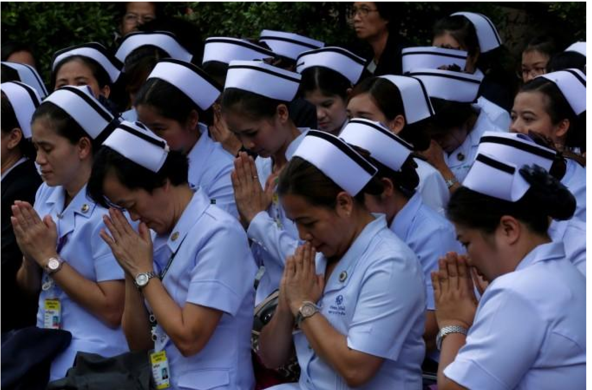
Representational image