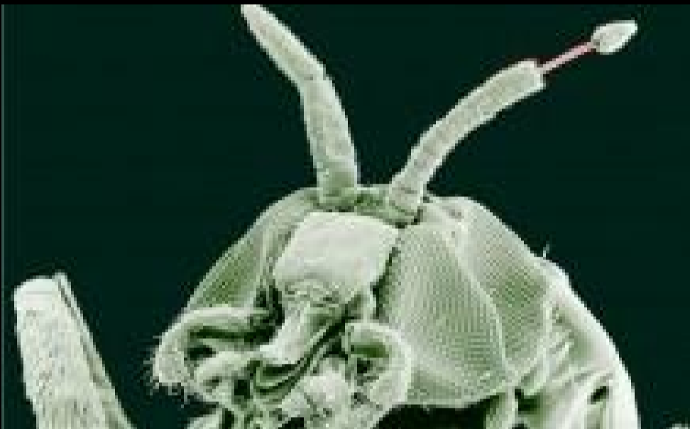
Zombies In Denmark; New Fungi Species Eat Flies' Organs While Insect Lives