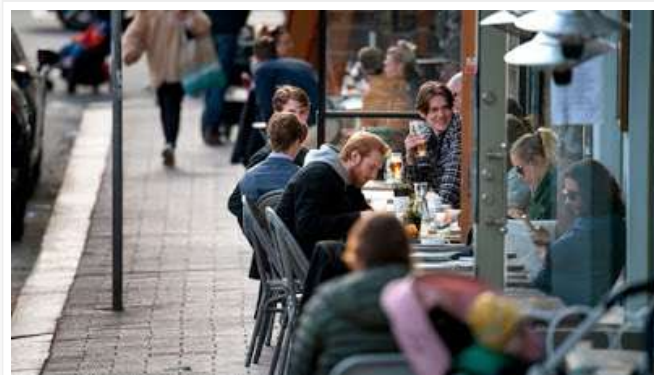
Sweden as most of the US is locked down.

T.J. Rodgers, the founder of Cypress Semiconductor, writes in The Wall Street Journal :