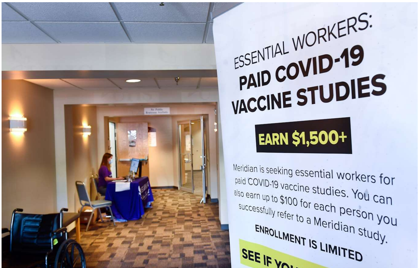
A poster seeking volunteers to take part in a COVID-19 vaccine study by the NIH and Moderna Inc., July 27, 2020, in Binghamton, N.Y.

A month earlier, the NIH had claimed a joint stake in Moderna's mRNA COVID-19 vaccine, citing a contract signed in December, 2019, stipulating that the "mRNA coronavirus vaccine candidates [are] developed and jointly owned" by both parties. Moderna disputes the federal government's position, stating that the company "has a broad owned and licensed IP estate" and is "not aware of any IP that would prevent us from commercializing our product candidates, including mRNA-1273."