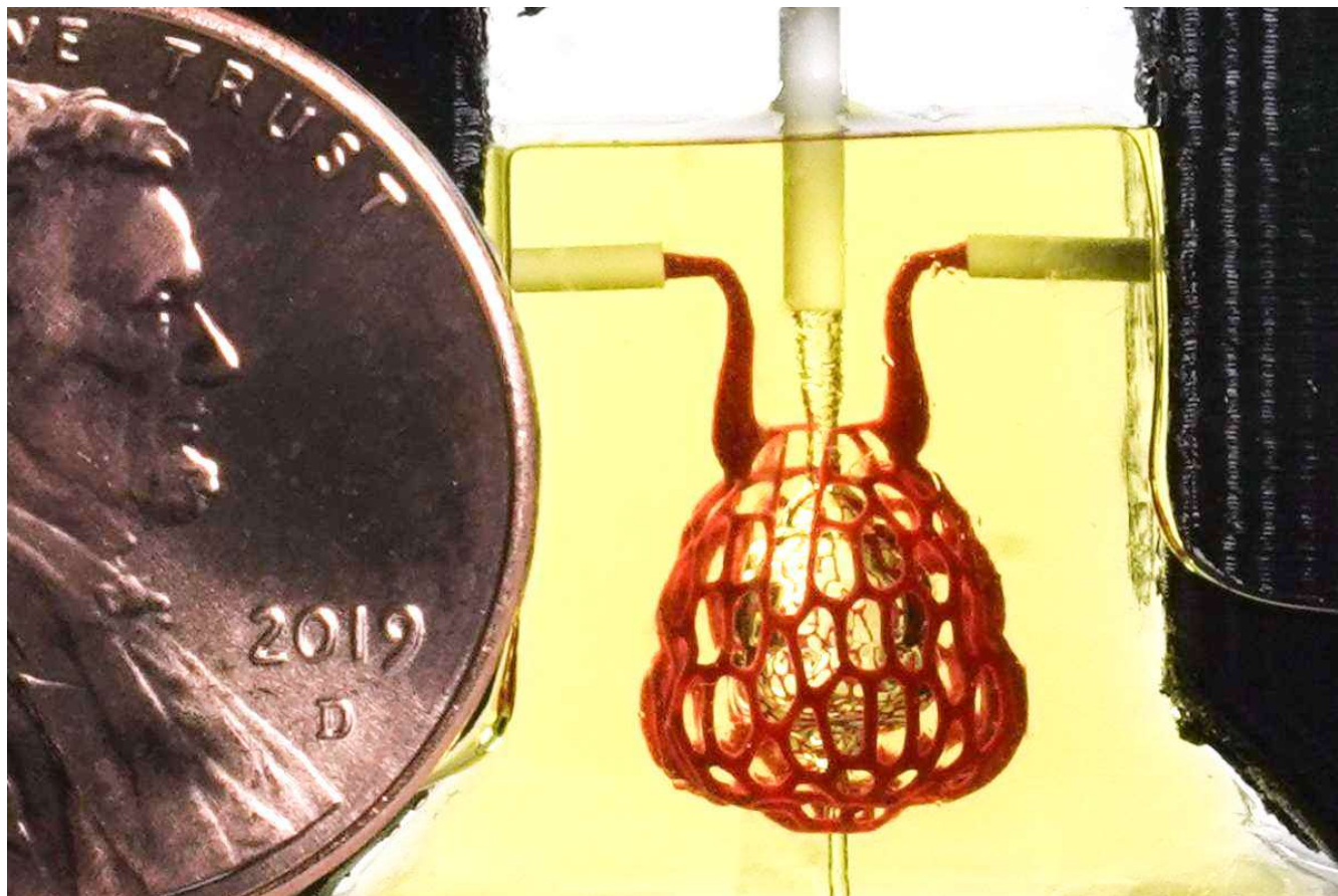
A penny aside a 3D printed hydrogel model of a lung-mimicking air sac in Rice University's Houston BRC lab.